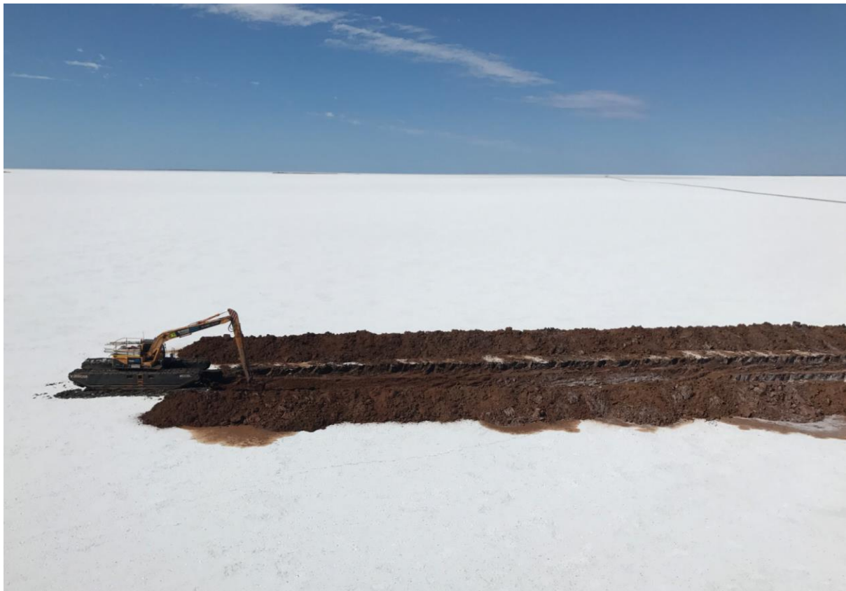
Figure 1. Construction in Progress at T17

Agrimin’s CEO, Mark Savich commented: “Commencement of this major work program on Lake Mackay marks an exciting new phase for Agrimin. The Company will construct 2km of trenches to demonstrate the Project’s ability to exclusively use shallow trenches to support a large-scale and long-life SOP operation.”