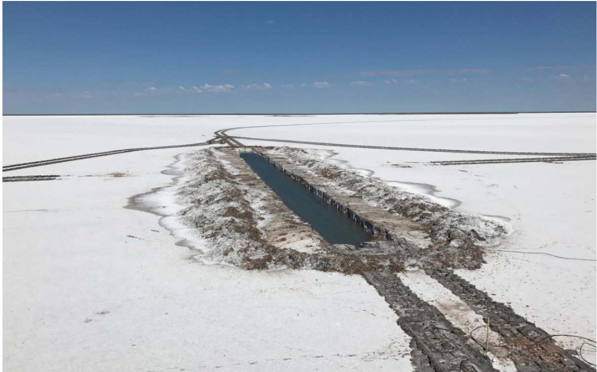
Figure 3. Construction Completed at T16

The construction of T17 is nearing completion and will have dimensions of 100m long by 7m wide and 5.5m deep ( Figure 1 ).