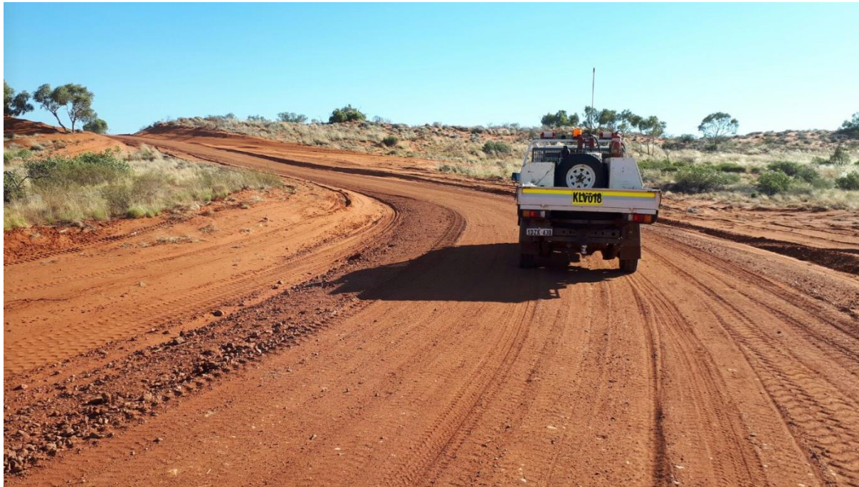
Figure 3. New Access Track to Pilot Evaporation Ponds

The Company has also recently completed a major track construction and maintenance program ( Figure 3 ). This has improved existing site access in anticipation of increased fieldwork activities during 2018. A new track provides access to the edge of Lake Mackay where pilot evapotranspiration ponds are currently being constructed.