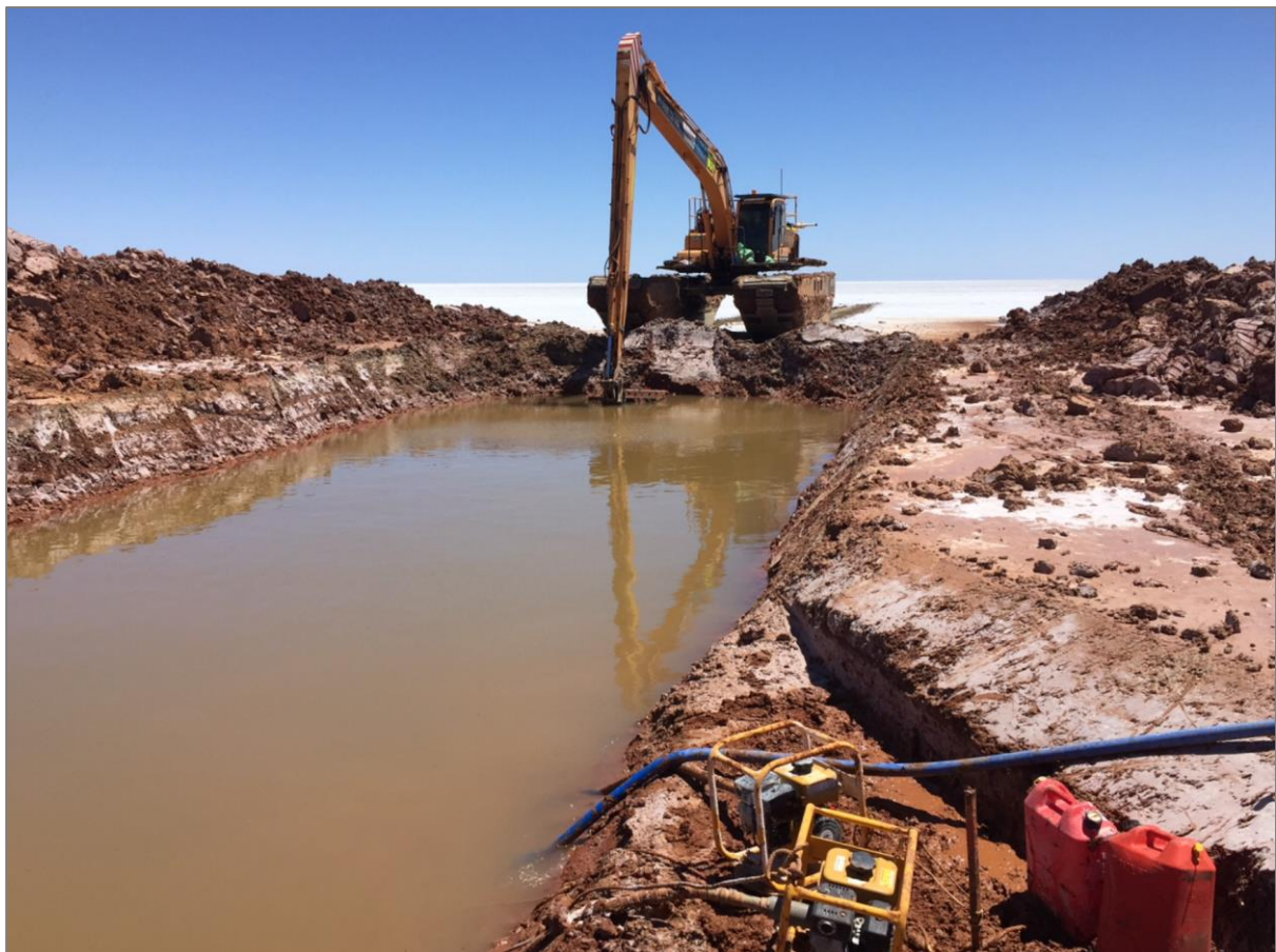
Figure 1. Pilot Trench During Construction

Agrimin Limited (ASX: AMN) (“Agrimin” or “the Company”) is pleased to report an update of results from long-term pumping tests undertaken at the Mackay Sulphate of Potash (“SOP”) Project in Western Australia.